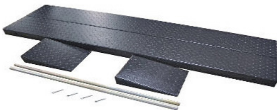
The Width Extension Kit.

To prevent hospital beds from sliding off, the hospital bed maintenance lift is supplied with a 20 mm safety lip around the sides, as well as a Width Extension Kit (pictured below) for an additional 600 mm on each side.