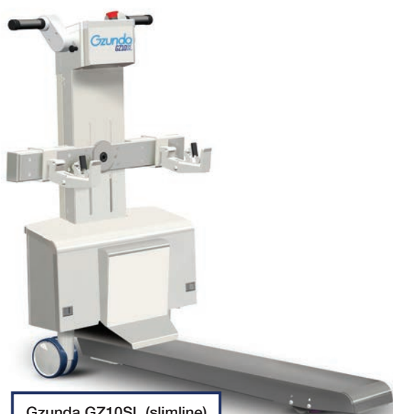
Gzunda GZ10SL (slimline)

This compatibility chart lists products that have been tested successfully with one or more of our patient movers and approved for use by Electrodrive.