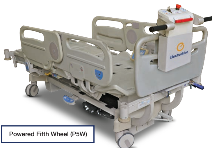
Powered Fifth Wheel (P5W)