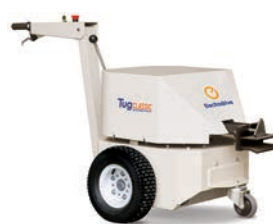
Tug Classic 3.5 tonne load capacity