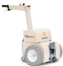
Tug Compact 500 kg load capacity