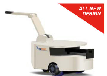
Tug Smart 5 tonne load capacity