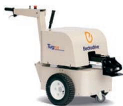
Tug Evo 1T & 2T 1–2 tonne load capacity