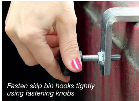
Fasten skip bin hooks tightly using fastening knobs