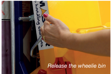
Release the wheelie bin