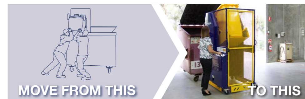
Waste management solutions.