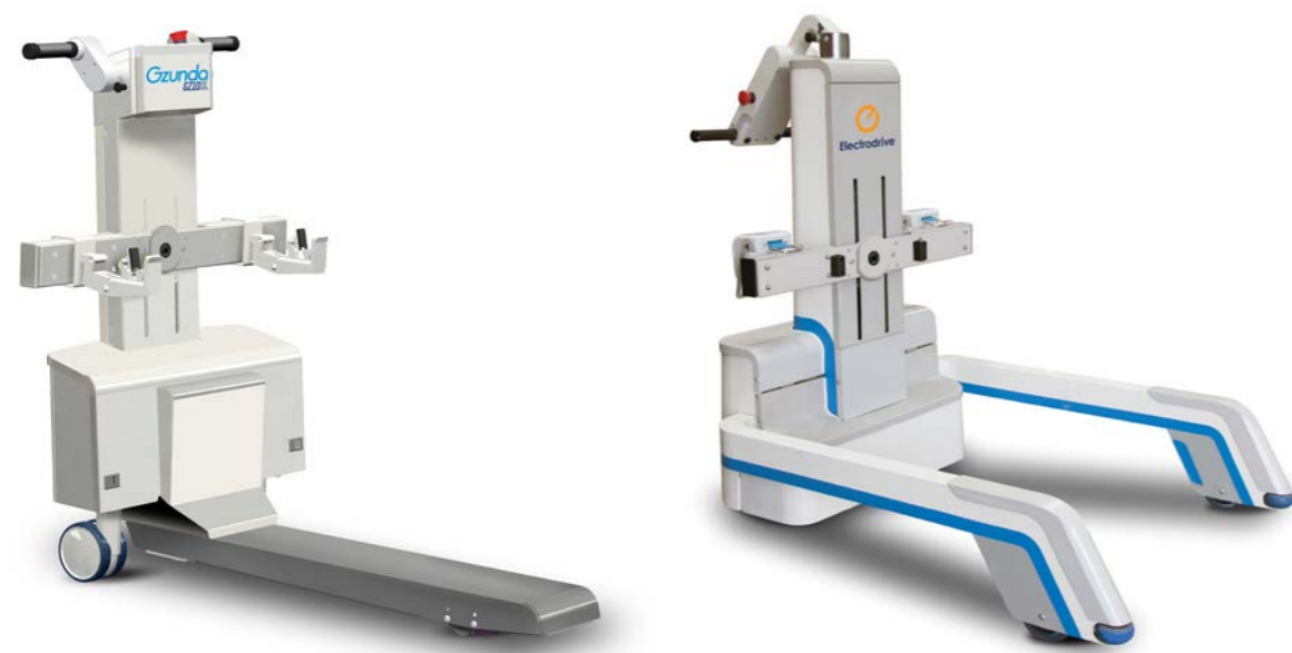
GZ10SL ('slimline') bed mover