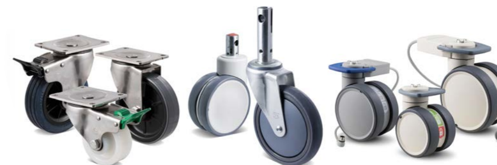
Castors for repairs and maintenance (including fitting service).