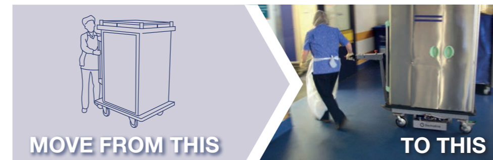
Powered meal delivery systems.